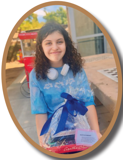
Happy Basket Winner